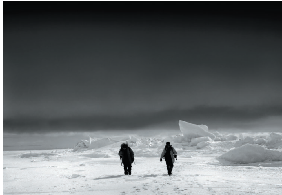
BELOW Researchers, Beaufor Island