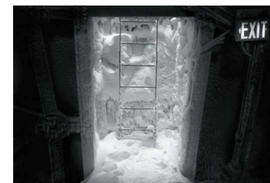
ABOVE Minna Bluff