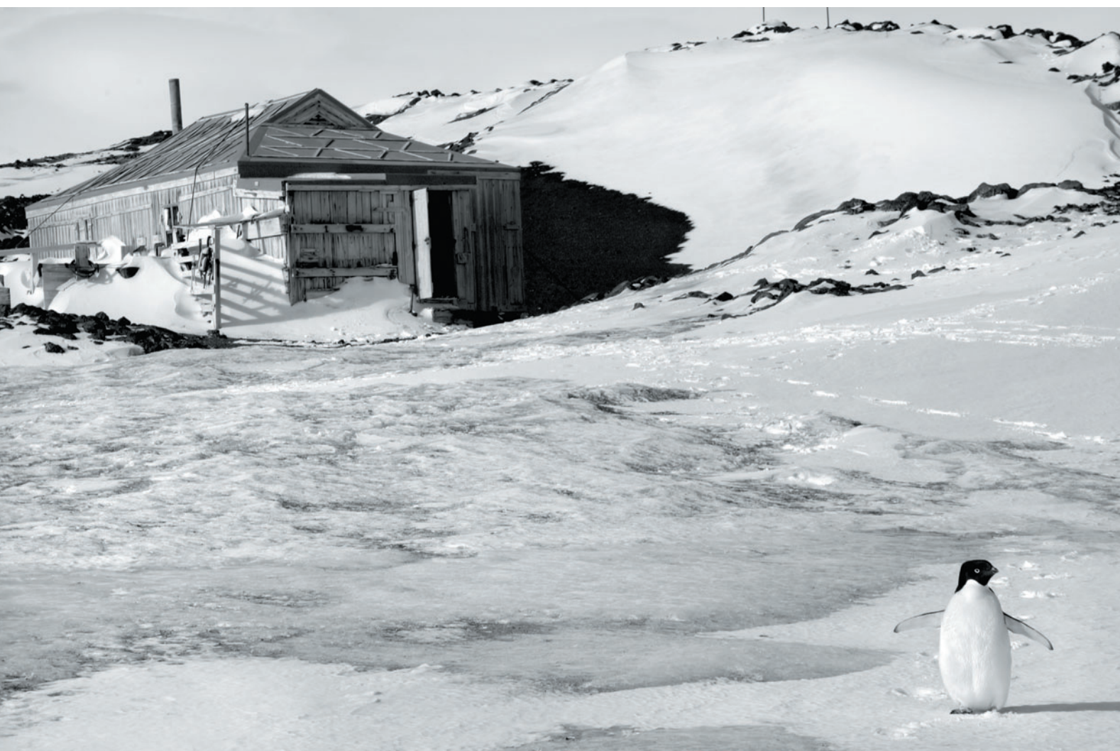
BELOW Cape Royd's hut built by Shackleton and his crew in 1909