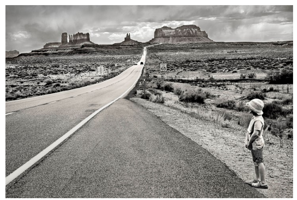
Joan Myers, Monument Valley, UT, 2021, 20 x 30", archival pigment ink print, edition of 10.